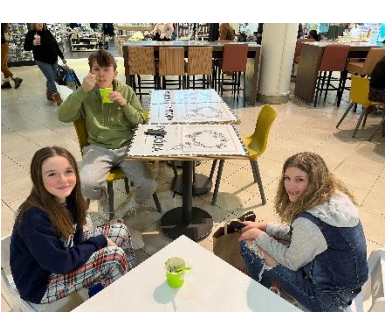
Trip to the Danbury Fair Mall; Hide N Seek, Soul Talk & Supper, Confirmation.

Our tweens and teens face challenges that many of us have never had to learn to cope with: social media, vaping, cyber-bullying, active shooter drills. It can seem overwhelming. At Salem, we hope to provide them a little respite with a safe place to hang out and know they are loved by God and us. These are a few random pics from our time together.