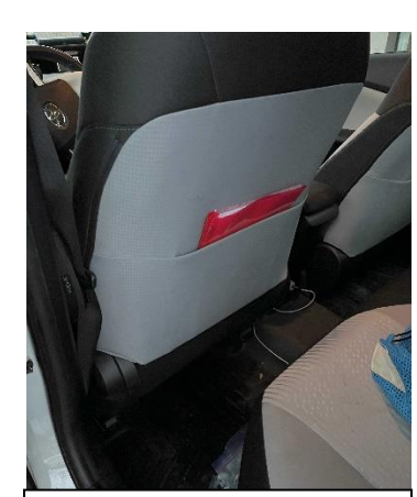
The missing case/glasses Do you see them?

"What?" I asked. He said, "Look again." I followed his instruction, and again, 'What? I don't see anything.' A third time, he pointed his finger straight at a particular spot, and said, "Look!" There jammed tightly in between the seat back and the seat belt were my glasses, well camouflaged in black.