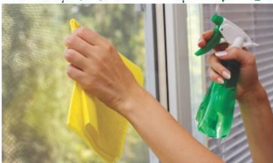
Sunday, November 19, 8:00 am